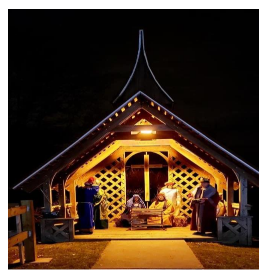
Live Nativity - December 4, 2021