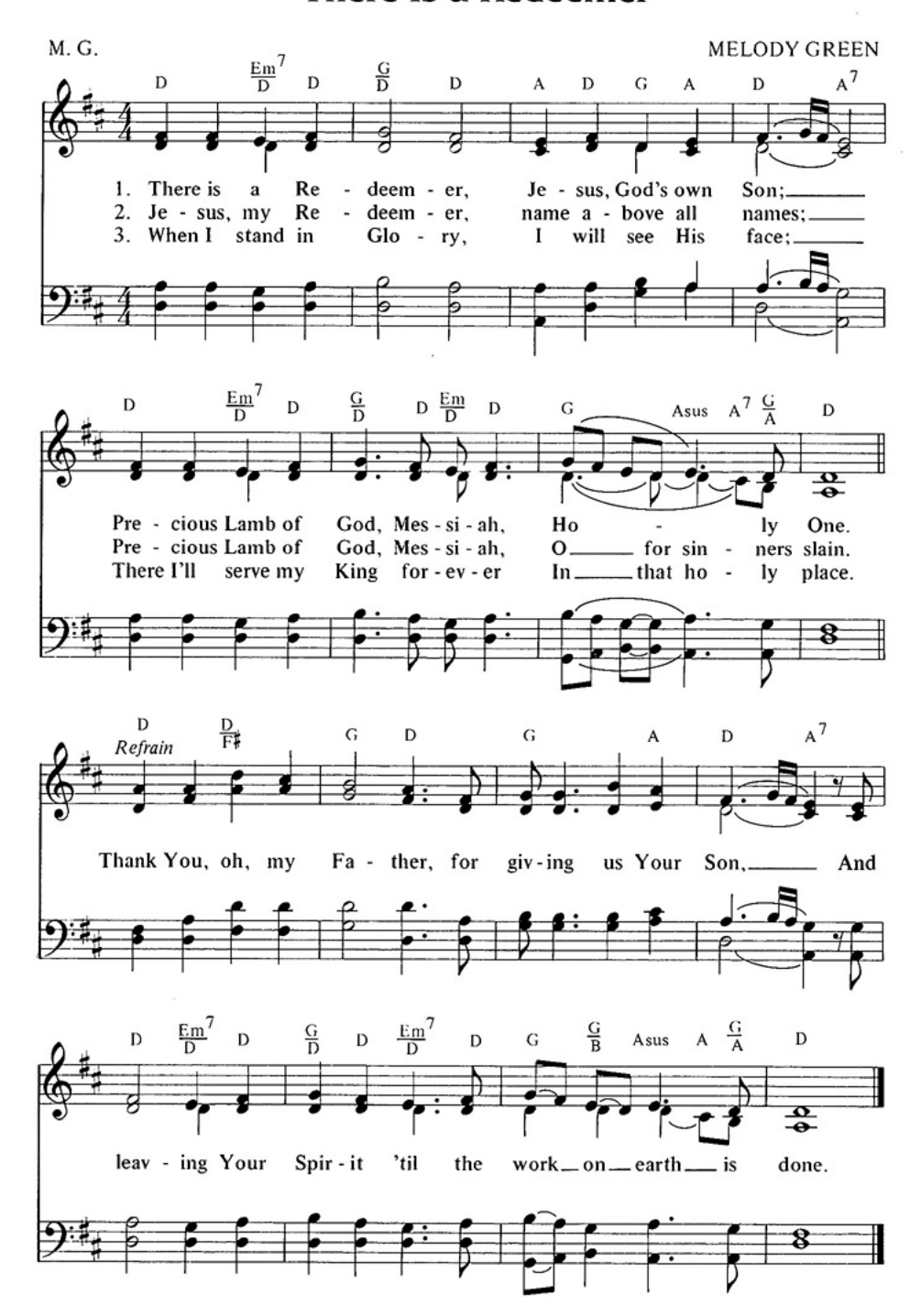
© 1982 Birdwing Music/Cherry Lane Music Publishing Co., Inc. All rights reserved. International copyright secured. Used by permission.